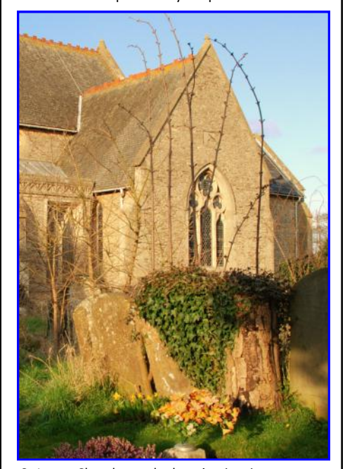
St James Church, south elevation in winter sun

BABYSITTING 01235 869100. Reliable 16-year-old Headington schoolgirl living in East Hanney. Any day of the week except Tuesday, £7 per hour.