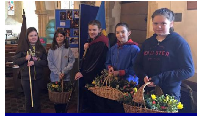
Members of Hanney Brownies prepare to hand out posies on Mothering Sunday, at St James Church