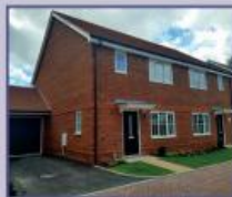
The Honeysuckle 3 Bedroom Homes