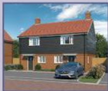
The Cornflower 2 Bedroom Homes