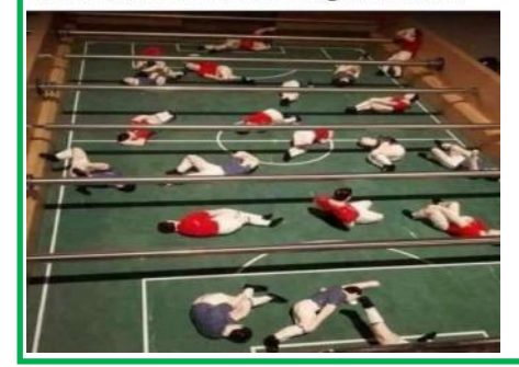
Table Football. Premier League version.

I used to love this game...still got a really good table here at Global HQ, hidden from the staff of course, else they'd never get any work done, but it's not the Premier League version depicted on the left.